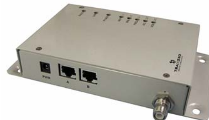
TR-600f model shown.

Now you can align your client and point to point installations without having to log into the radio. Get visual signal strength at a glance by using this great feature.